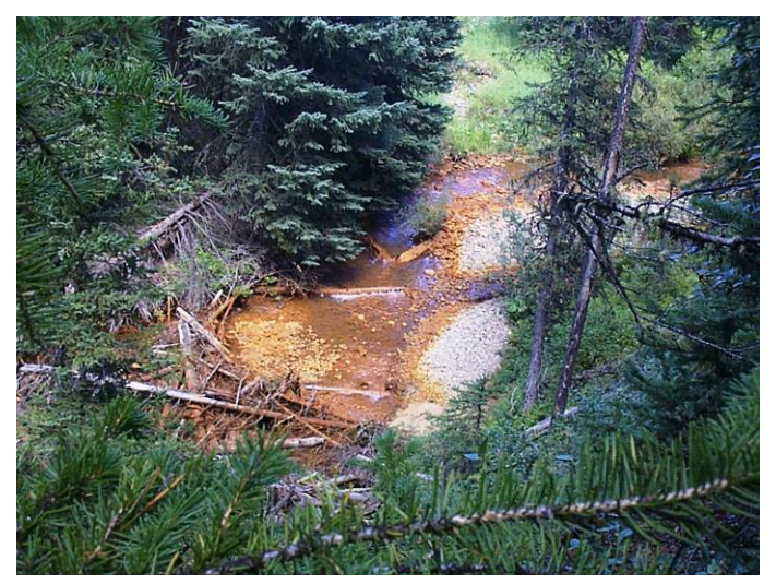
McLaren Tailings August 2005 photo: acid mine drainage discharging into Soda Butte Creek which flows downstream into Yellowstone National Park