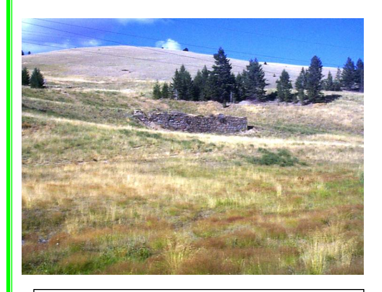
Gregory Mine (hardrock mine, mill & smelter), August 2005 photo: 91,000 cu. yd. of mine waste removed & transported to repositories; rock foundation left as evidence of historic mining