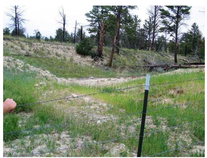
Musselshell Ranch (coal), June 2006 photo: recent reclamation to close collapsing mine shaft