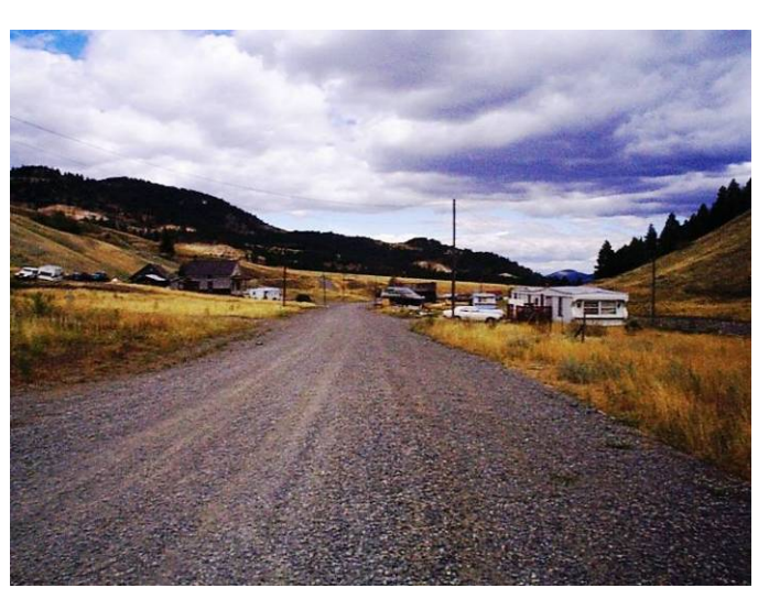
Wickes community August 2005 photo: after removal of 104,000 cu. yd. of heavy metal contaminated smelter wastes from residential areas, demolition & removal of two hazardous smelter stacks