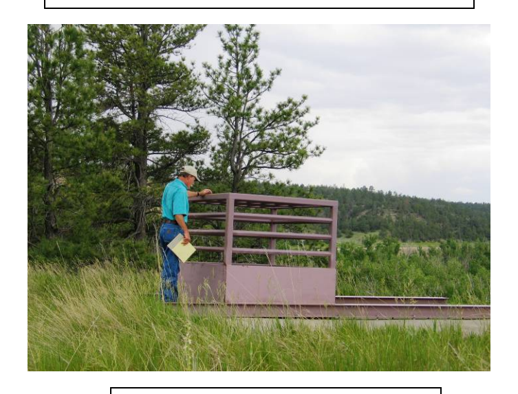
Republic No. 4 (coal), June 2006 photo: bat cupola erected with closure of vertical opening