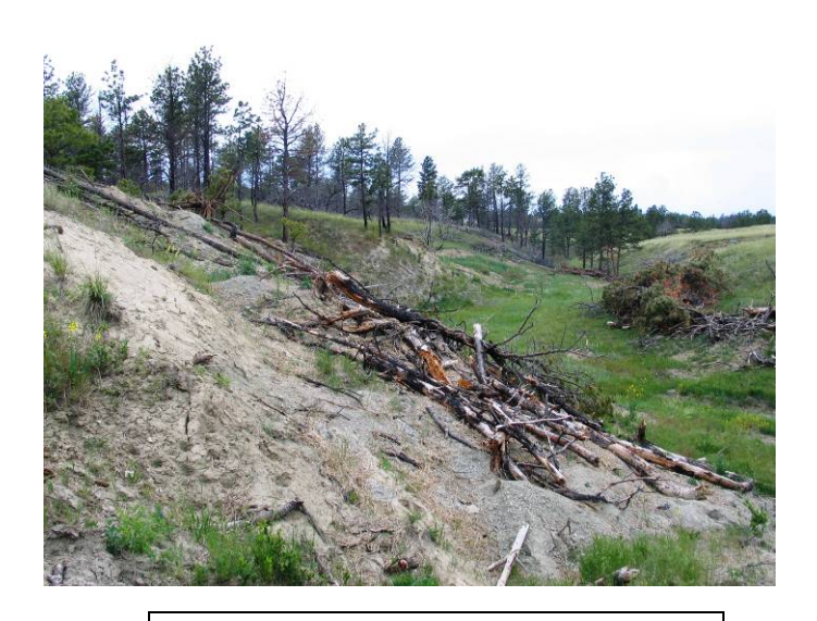
Musselshell Ranch (coal), June 2006 photo: burning coal slack and coal seam extinguished within past year