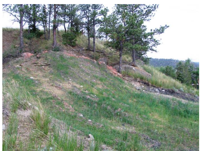
Republic No. 4 (coal), June 2006 photo: recent reclamation to close mine adit