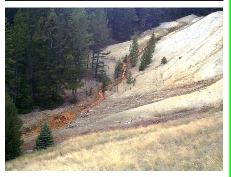
Bluebird Mine & Mill August 2005 photo: acid mine drainage