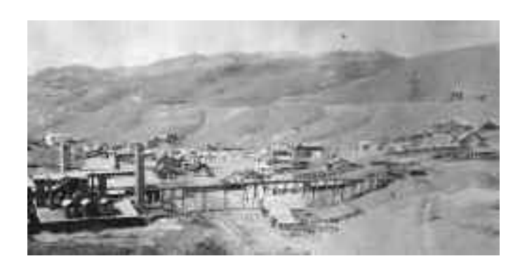
Wickes Smelter December 1886 photo