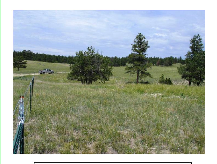
Keene No. 1 (coal), June 2006 photo: successful revegetation of reclaimed vertical opening and mine dump area