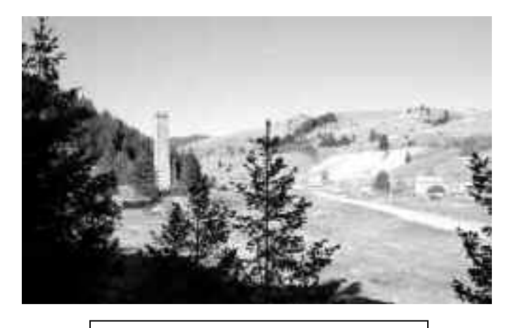
Wickes Smelter July 2000 photo showing smelter stack