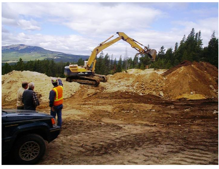
Ontario Mine August 2005 photo: excavation of approx. 10,000 cu. yd. of waste material contaminated with arsenic, barium and lead