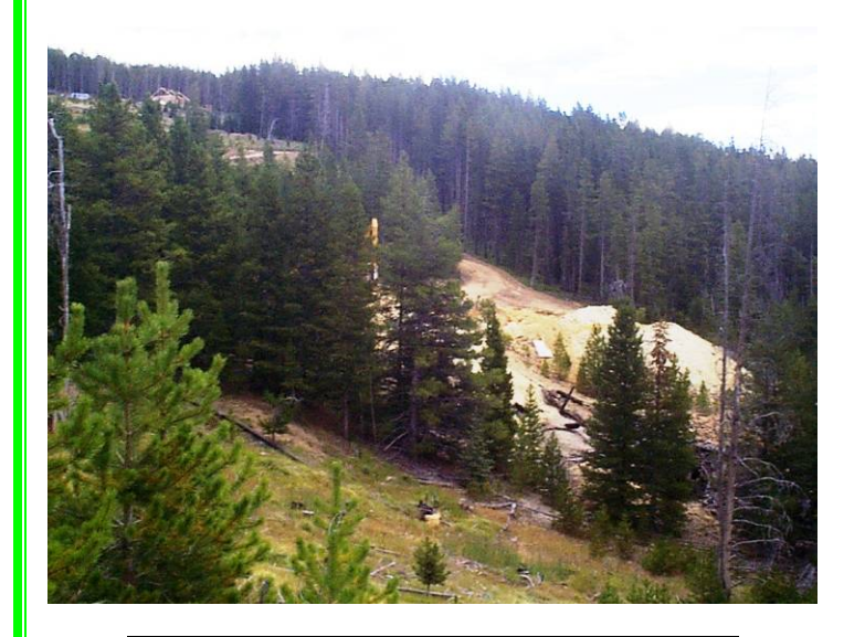
Ontario Mine (hardrock mine), August 2005 photo: initiation of reclamation

The following photographs have been attached to this report to further demonstrate the degree of hazardous conditions encountered in various areas of the State, and the excellent reclamation accomplished by the MWCB to eliminate the hazards.