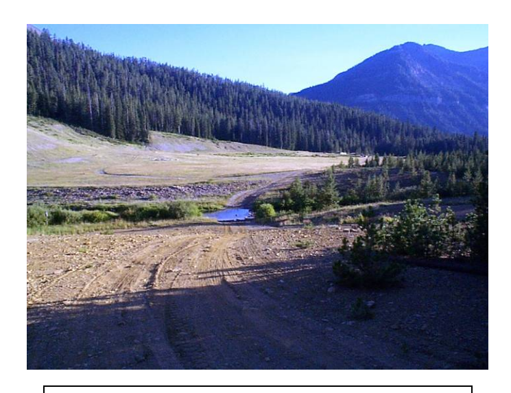
McLaren Tailings (hardrock mill tailings), August 2005 photo: scheduled for future reclamation to alleviate impacts to Soda Butte Creek which flows into Yellowstone National Park, five miles downstream