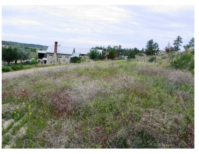
Keene No. 1 (coal), June 2006 photo: successful revegetation of reclaimed tipple site located near residence