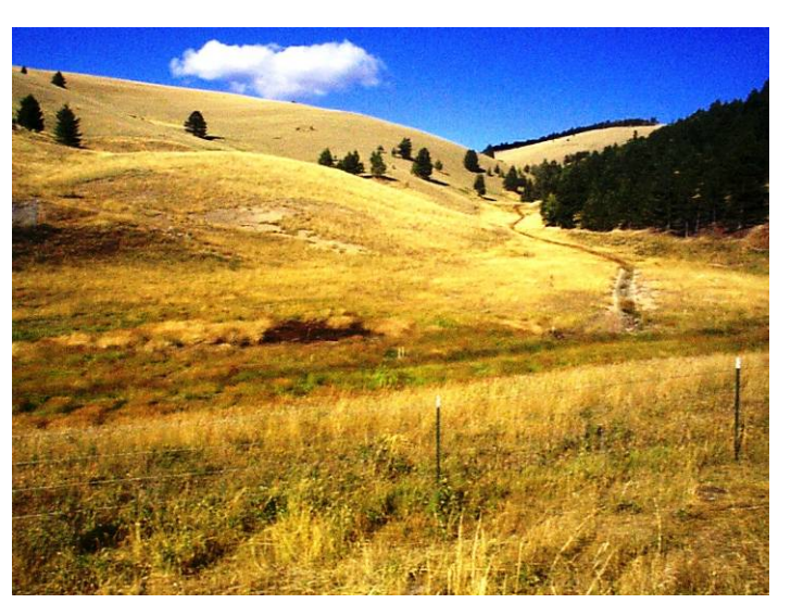
Gregory Mine August 2005 photo: reconstructed stream channel, successful revegetation